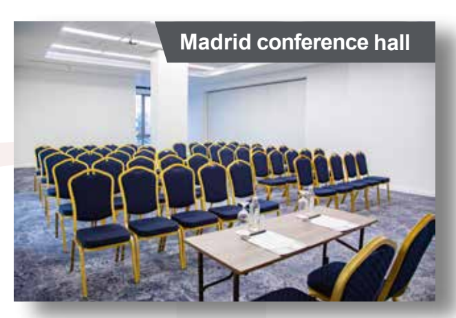
Create new points of view through dialogue and discussion Plan your next World Café Interaction, Open Space discussions or Peer Assisted Study Sessions with us

The way people work is changing We offer a new meeting experience with flexible workspaces, up-to date technology to inspire collaboration and creative solutions for the way you work today.